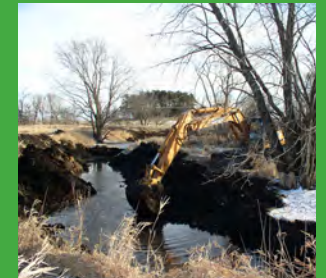
Oxbow during restoration