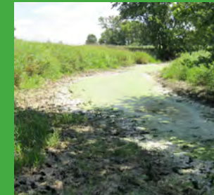
Oxbow before restoration