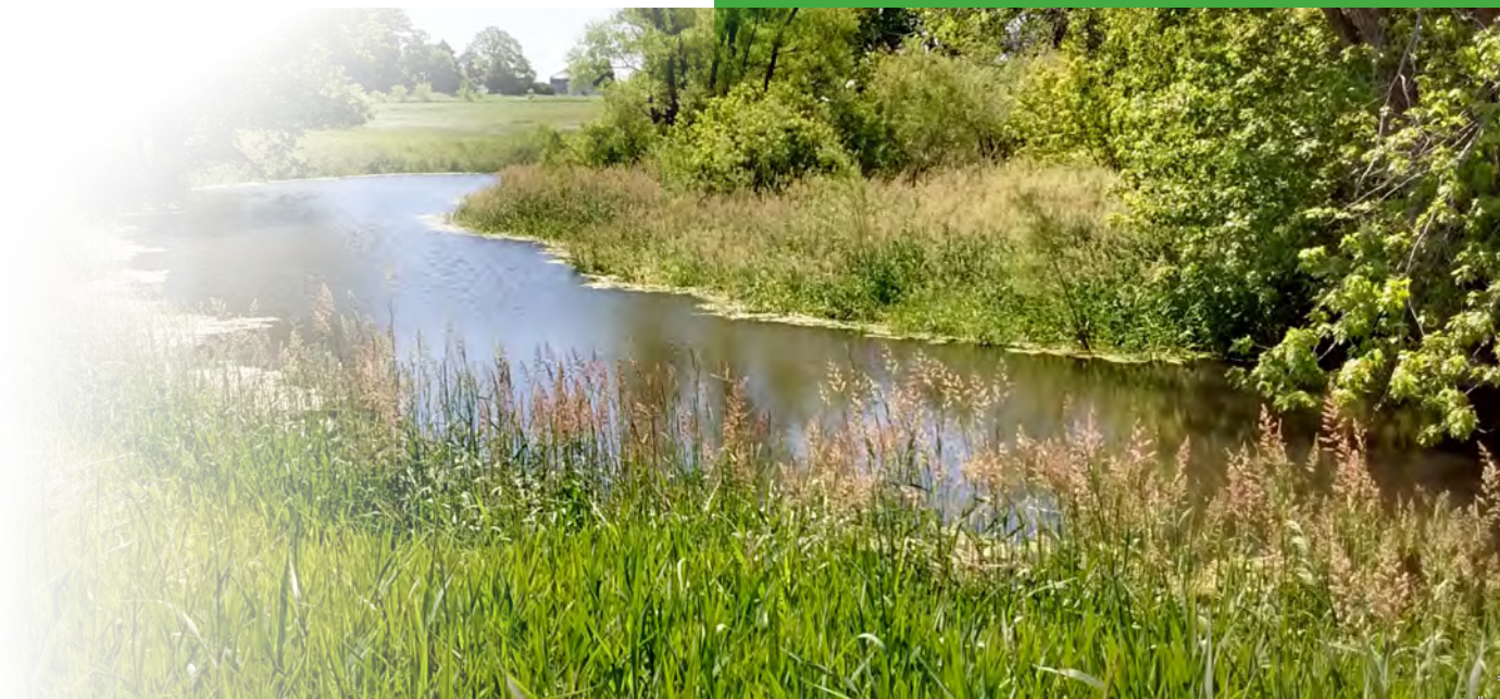
Oxbow after restoration