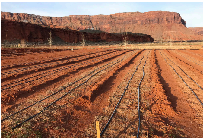
To date, biocrust inoculum source has been mostly cultivated under lab and greenhouse conditions, but scaling up restoration efforts to larger areas could benefit from large-scale cultivation in outdoor nurseries or “biocrust farms.” These organisms may also be naturally “hardened” to survive. This is the world’s first outdoor biocrust farm near Moab, Utah.

A recent outdoor cultivation experiment showed that biocrusts collected from the Mojave and Sonoran Deserts grew better in a biocrust farm on the Colorado Plateau compared to biocrusts locally collected on the Colorado Plateau. This study suggests biocrust from hotter deserts may enhance establishment and restoration success in some settings.